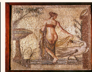
Leda & The Swan Mosaic, Kouklia

Sunday, 6th July: Registration, Opening Ceremony, Session 1&2. Welcome Reception Monday, 7th July: Morning to Evening: Scientific Sessions. Evening: Social Program Tuesday, 8th July: Morning to Evening: Scientific Sessions. Evening: Social Program Wednesday, 9th July: Morning Scientific Sessions. Afternoon - Excursion Thursday, 10th July: Morning to Evening: Scientific Sessions. Evening: Social Program Friday, 11th July: Morning to Evening: Scientific Sessions. Evening: Cypriot Night Saturday, 12th July: Morning: Scientific Sessions. Midday: Closing Ceremony